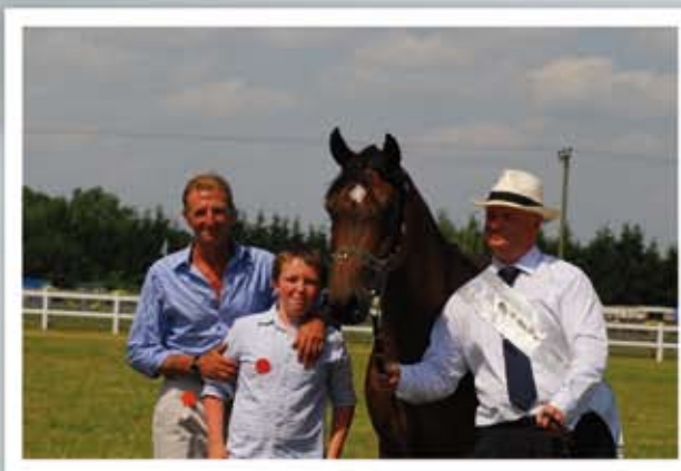
Silver Champion Gelding