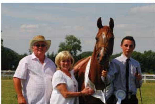
Silver Champion Senior Female