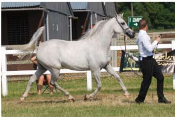
Silver Champion Junior Female